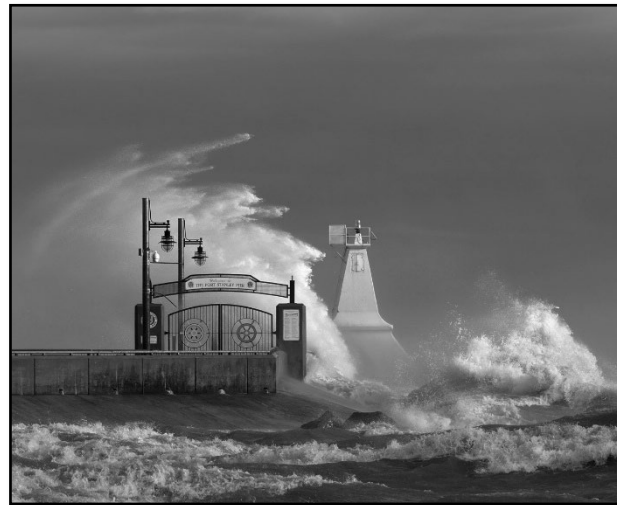
Wild Waves by Christy Guertin Winner 2023 Annual Travel Award

SPC is proud to support the Lambton College Photography Program